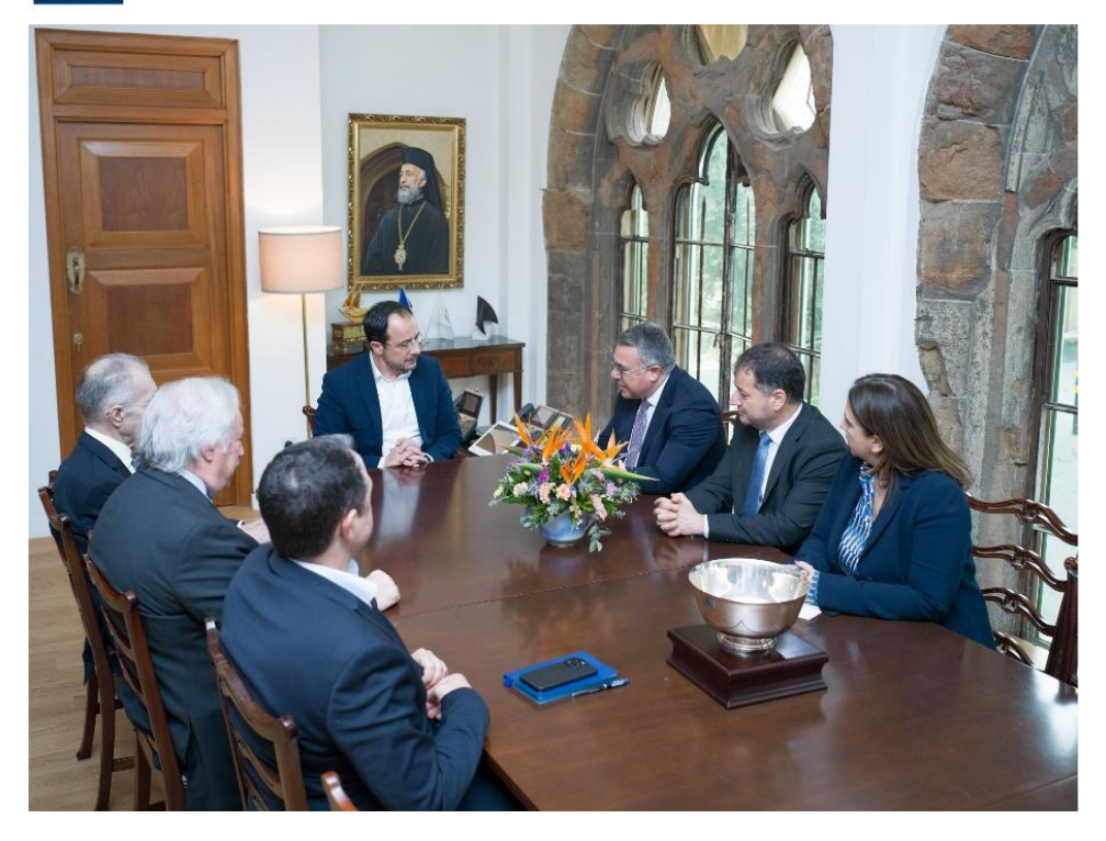
Photo 2: Snapshot of the meeting at the Presidential Palace of Cyprus.